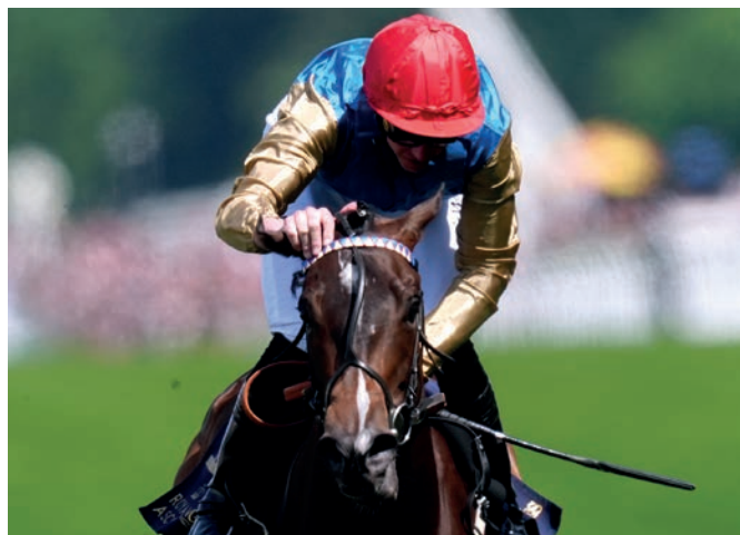
Leovanni winning the Queen Mary Stakes at Royal Ascot 2024.

1st ROGUE LEGEND (17) 2nd UTMOST RESPECT (22) 3rd OLD IS GOLD (16)