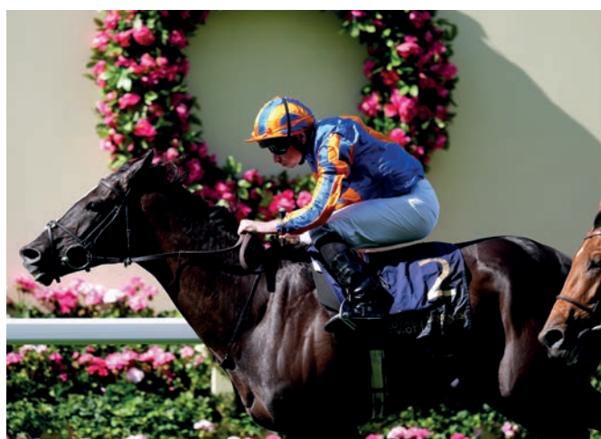
Auguste Rodin winning the Prince of Wales's Stakes at Royal Ascot 2024.