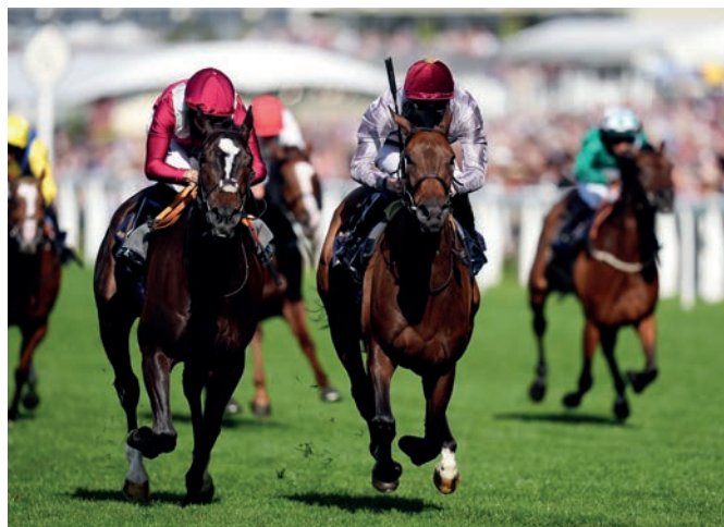
Doha winning the Kensington Palace Stakes at Royal Ascot 2024.