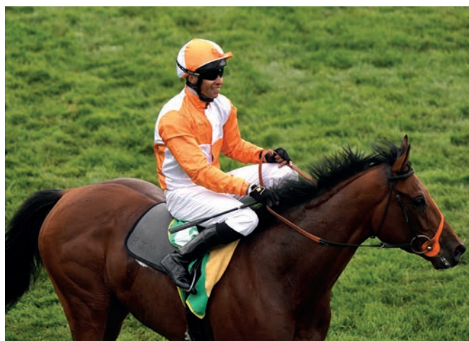
Jayerebe winning the Hampton Court Stakes at Royal Ascot 2024.