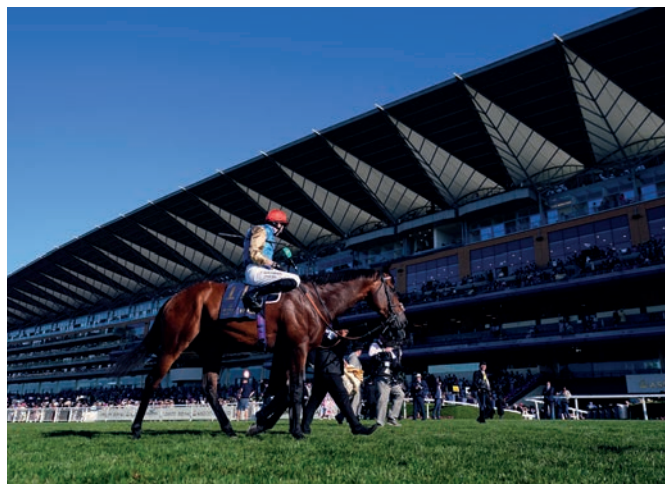
English Oak winning the Buckingham Palace Stakes at Royal Ascot 2024.