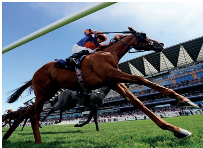
Port Fairy winning the Ribblesdale Stakes at Royal Ascot 2024.