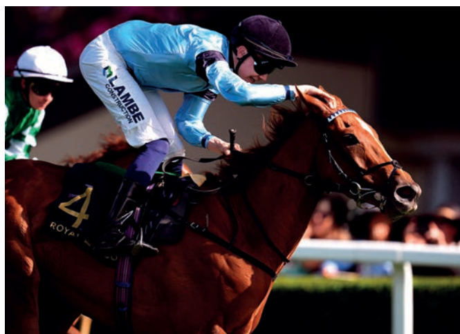
Soprano winning the Sandringham Stakes at Royal Ascot 2024.