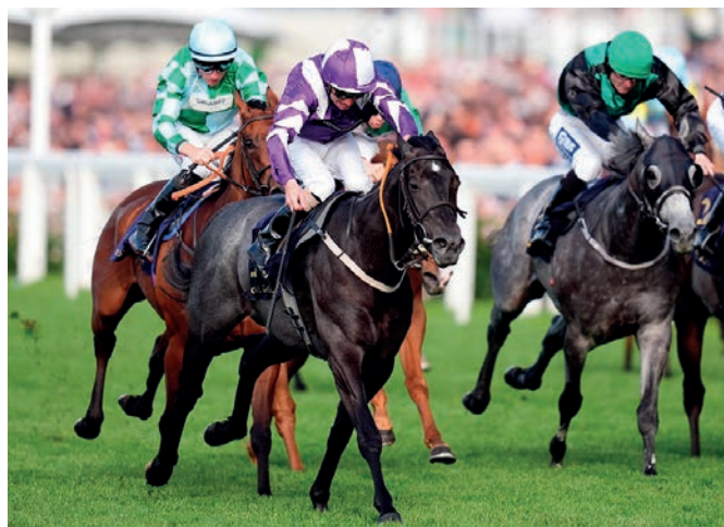
Pilgrim winning the Palace of Holyroodhouse Stakes at Royal Ascot 2024.