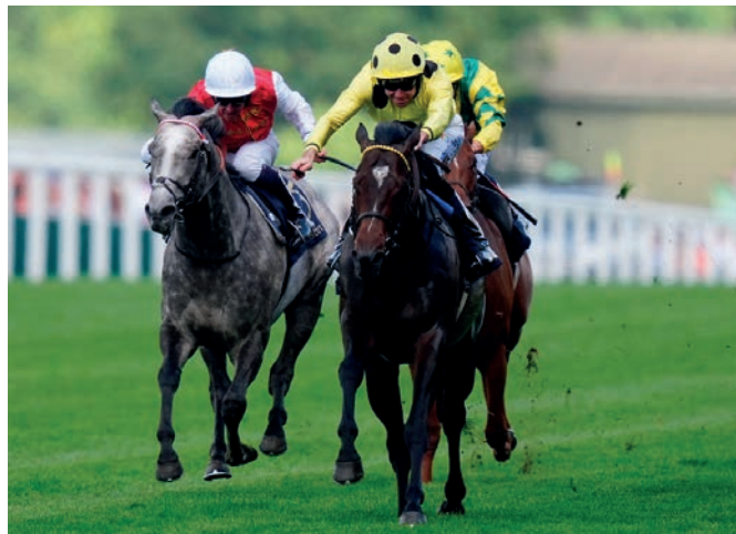
Inisherin winning the Commonwealth Cup at Royal Ascot 2024.