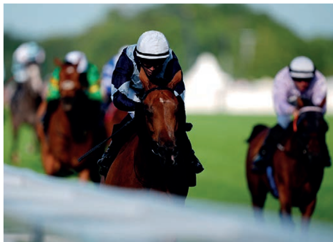
Uxmal winning the Queen Alexandra Stakes at Royal Ascot 2024.