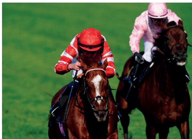
Hand of God winning the Golden Gates Stakes at Royal Ascot 2024.