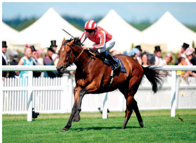
Isle of Jura winning the Hardwicke Stakes at Royal Ascot 2024.